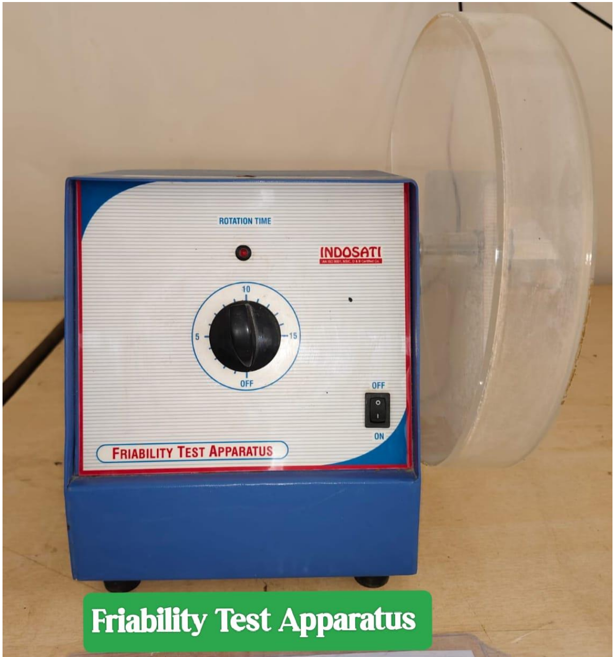
Friability Test Apparatus