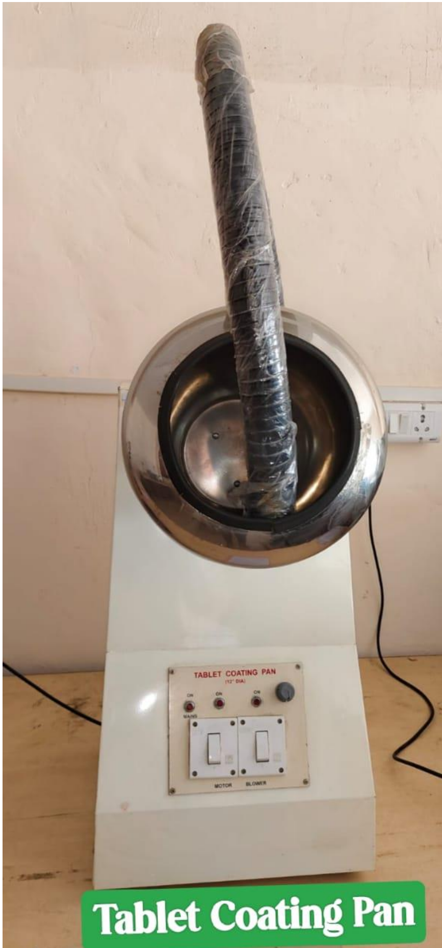
Tablet Coating Pan