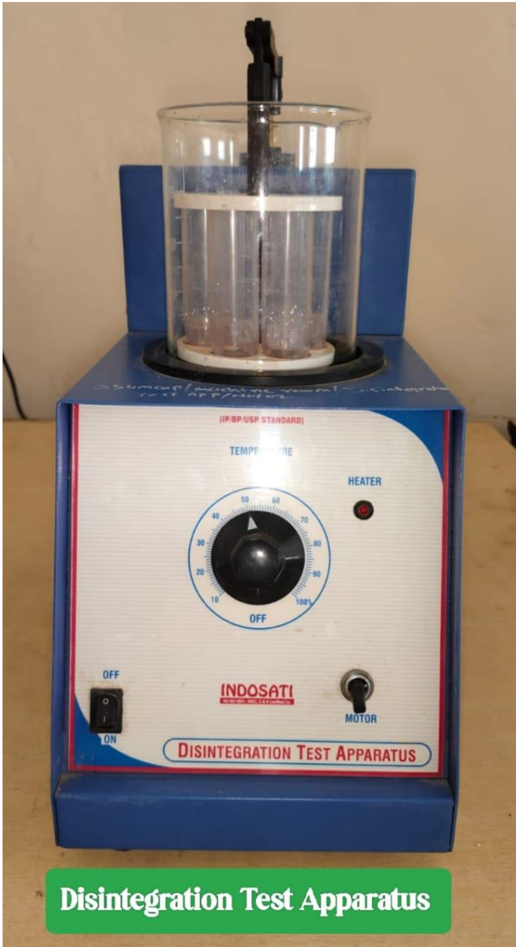
Disintegration Test Apparatus